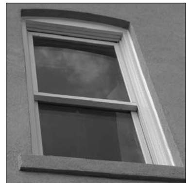
The Beloit Hilton project, shown here, was another project that required historic windows with modern-day innovations.

and a solution for the exterior trim components. Pozzi Custom products allowed Scott to satisfy all these requirements within budget, on time, and without hassles for Maas Brothers Construction , the General Contractor for the project.