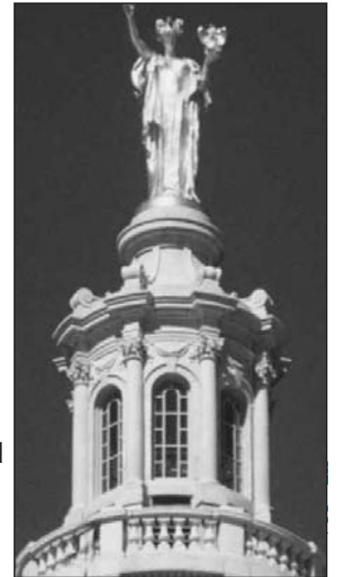
These Marvin windows, were created from the original 1906 drawings shown at left.

THE SOLUTION: Vaughan researched the original blueprints, then took exacting measurements to create windows made to the 1906 drawings. To reach the interior he scaled six floors of circular iron stairways suspended from the dome. He utilized scaffolding in place around the dome to obtain exterior measurements. The new Marvin windows are true divided lite windows with radiused thermal panes. The windows were crafted to fit perfectly into the existing frames.