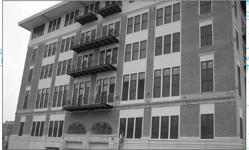
Pozzi Windows® were chosen for the City Lofts condo project in downtown Milwaukee based on versatility, style, and functionality.