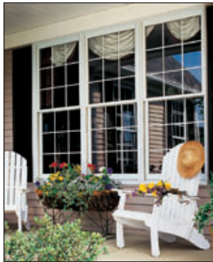
Visit windowcenter.com to see our Gallery of Projects with beautiful window and door ideas.

Our actual window and door showroom on Seybold Road is a great place for you or your clients to see our products, but our online Gallery of Projects offers plenty of inspiration. When you're ready, provide your name and contact information online, and we'd be glad to set up a showroom visit with your specific needs in mind.