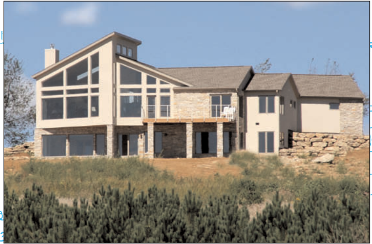
The two-story window walls created for this home overlook Lake Wisconsin and offer a vista that includes the Merrimac Ferry run. Jeld-Wen Pozzi windows and patio doors with high performance glass, exterior clad finish, and an exceptional 20-year warranty suited the job perfectly.

Kurt Waage of Waage Construction, LLC, appreciates fine construction materials, and utilizes high-quality windows from Window Design Center as intrinsic design elements. The two homes featured here were each designed and built to focus on exceptional lake views, so it is natural that the windows stand out.