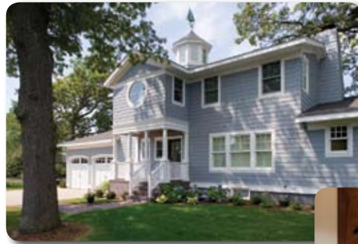
Clockwise from top: front of home featuring large circular window; cupola over stairway; double-hungs with custom shutters.