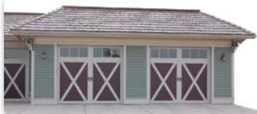
This three-car carriage house was also rebuilt to match what existed before the tornado. Jeld-Wen garage doors replicate the originals, and customized transom lights were placed above them to maintain the lines.

Jim credits Jody Lindsey of Window Design Center with fine-tuning the detailed installations, and timing deliveries to suit the construction schedule. "I needed someone local who could handle all the meticulous details, and knew I could count on Window Design Center."