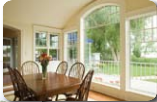
Clockwise from top: Palladian-inspired windows open dining room to lake views; arched window with casements; back of house.

Barnett emphasized the New England look with wood shingle siding and divided lite windows, but used distinctive Marvin windows and doors throughout. A circular window on the front of the home reinforces the nautical theme.