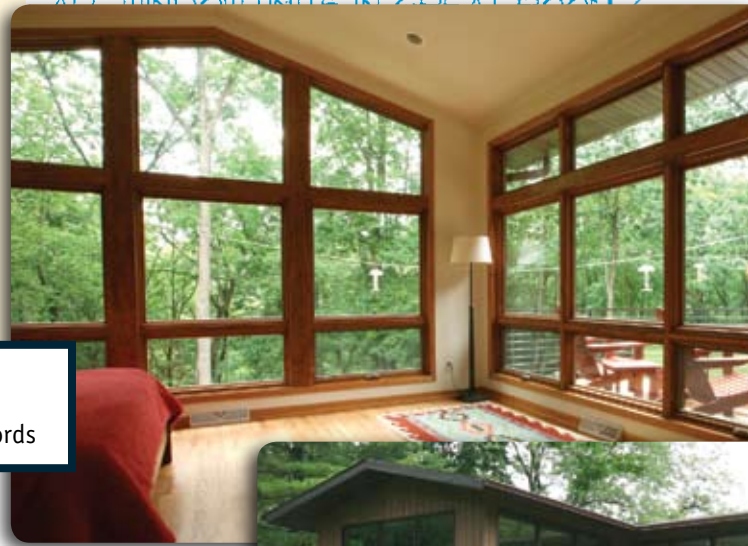
ALL WINDOW UNITS IN GREAT ROOM

THE ISSUES: Challenging wall of windows, and exact match