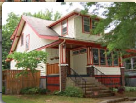
Hotel Ruby Marie (above) and 1511 Rutledge St. (right) both won awards for historic preservation.

drawings and designed Marvin true divided lite windows to replicate the original style.